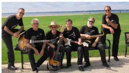
The Same Old Guys