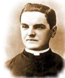
Blessed Father Michael J. McGivney

Please visit our sick and shut-in Brothers. If you are unable to visit, please send a card with a note. It will be very much appreciated.